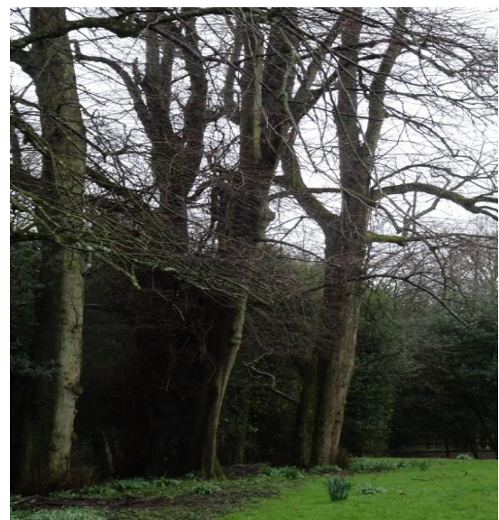
Views of the rear garden (2019) C. de Carle