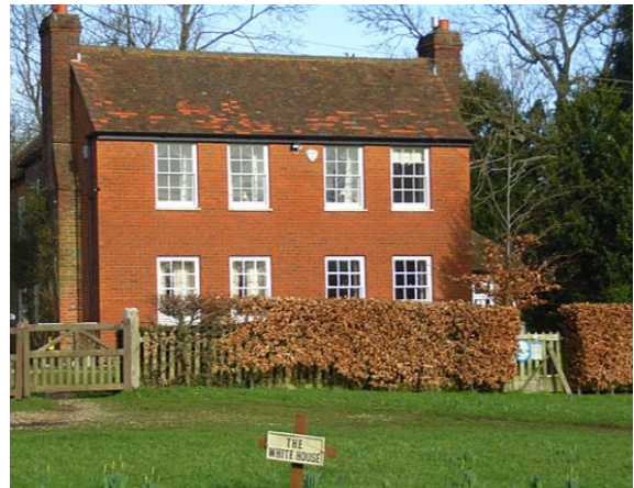
The White House before and after alterations