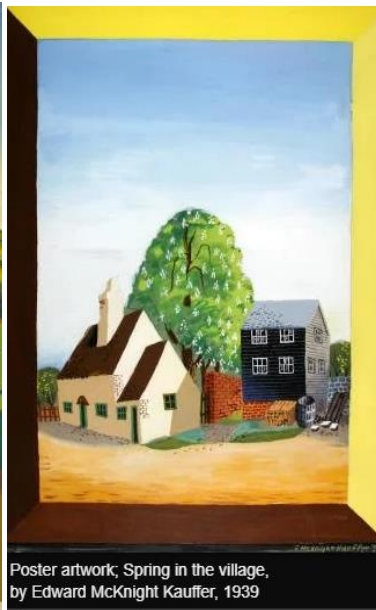
Poster artwork; Spring in the village, by Edward McKnight Kauffer, 1939