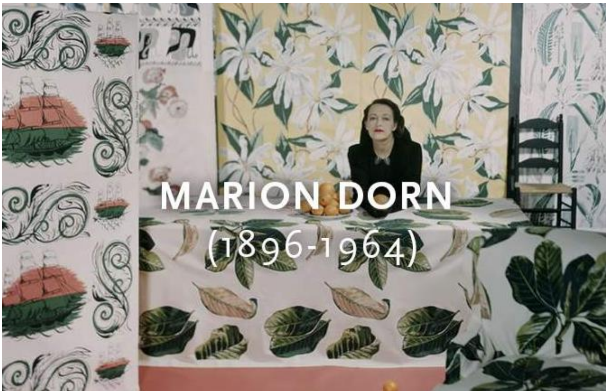
Fabrics for House and Garden 1947 (Décor Arts Now) https://www.fjhakimian.com/blog/marion-dorn (accessed 19/11/20)

For paintings by Wellington (none of Bucks) go to: https://artuk.org/discover/artists/wellington-hubert-lindsay-18791967