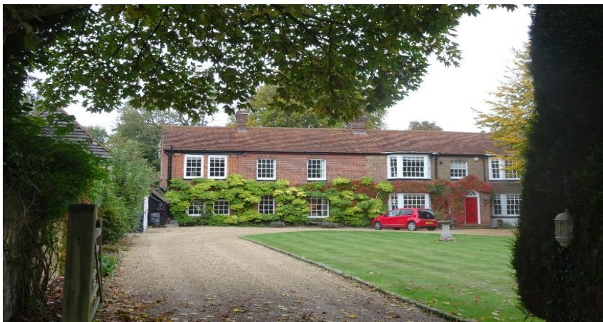
Manor Farm, Chesham Bois 2020