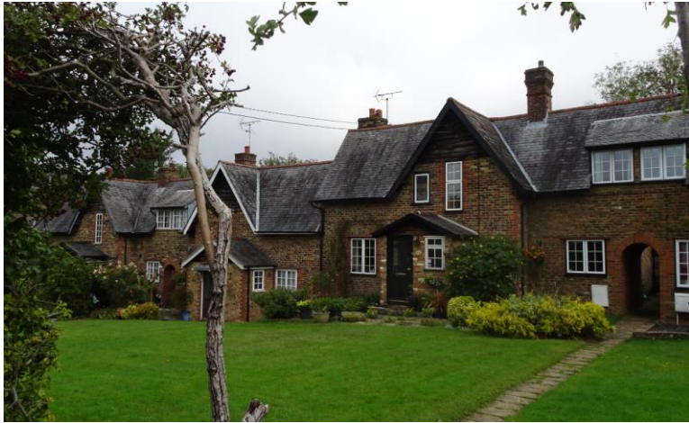
Arts and Crafts Cottages, The Woodlands 2020 (C. de Carle)