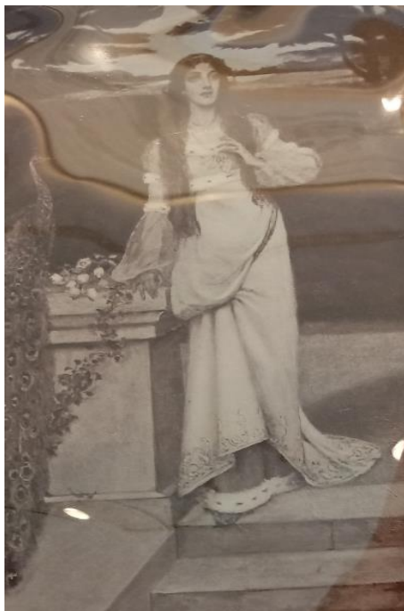
Elaine, the Lily Maid of Astolat 1875