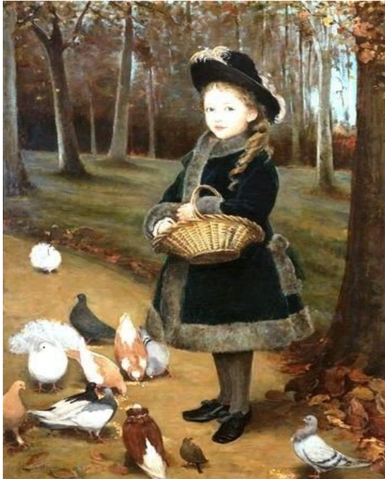
The Hon. Evelina Rothschild 1877 (Waddesdon)