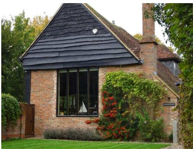
The Studio, Manor Farm (now in separate ownership) 2020