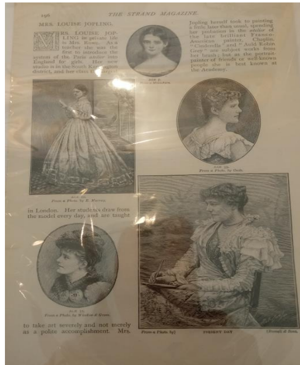
Article in The Strand Magazine 1898