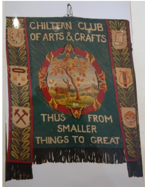
Items in Amersham Museum