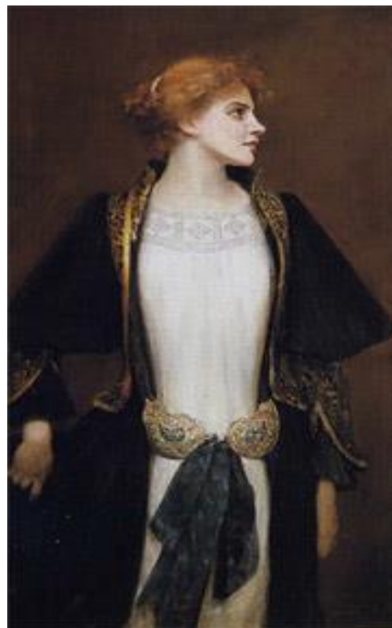
Dear Lady of Disdain 1891 (private collection)