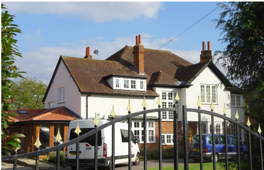
Wood Lane House, 2020

https://artuk.org/discover/artists/nash-paul-18891946/search/artists_auto:nash/page/2