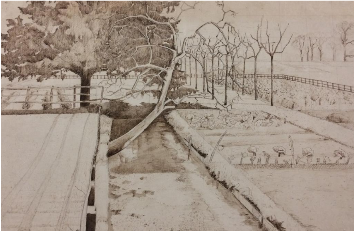
John Nash 'The garden' c.1915 (Bucks County Museum Collection)