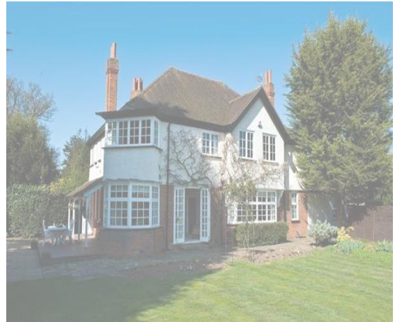
Garden front, Wood Lane House