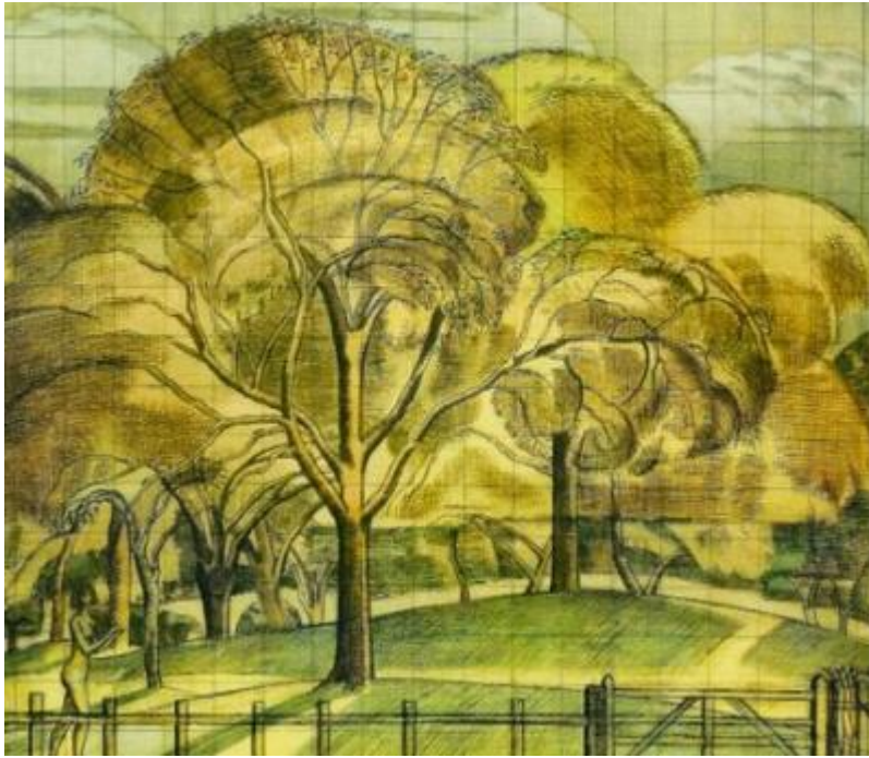
'The Orchard', Paul Nash, 1914