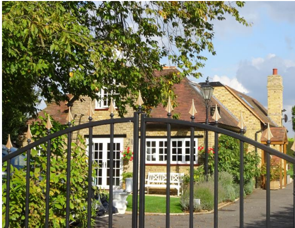
Former coach house, now (2020) in separate ownership