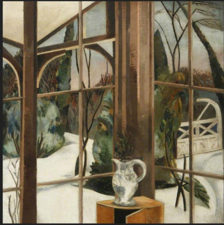
The Window, Iwer Heath Paul Nash (1889–1946) BBC England