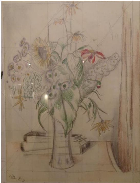
‘A vase of flowers’, John Nash (Cecil Higgins Art Gallery, Bedford)

The Nash archive is held by the Tate; however very little is available to view online.