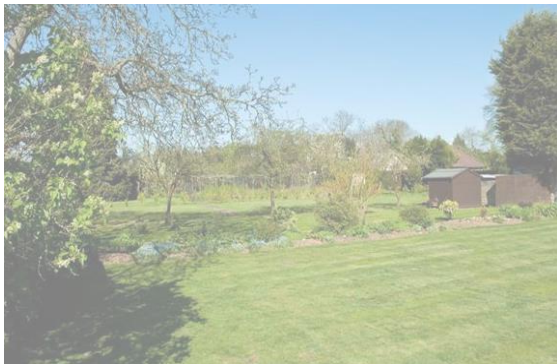
The rear garden